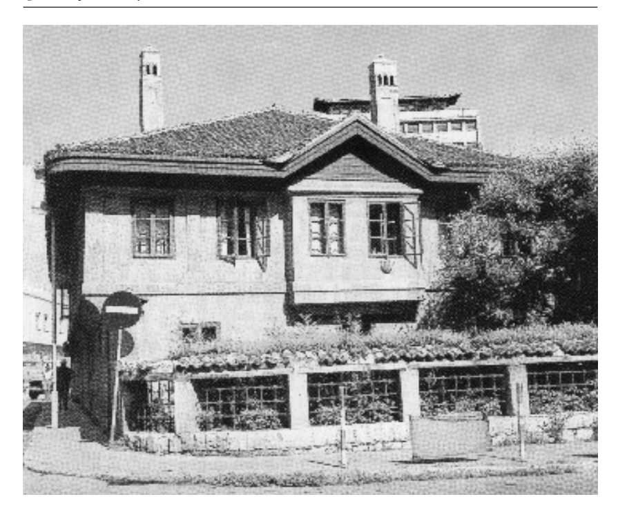
Illustration 1: The Vuk and Dositej Museum in Belgrade

prominent: the alleged link to Vuk Karadžić as his predecessor. The following five short quotes from mass media texts, from the 1960s and 2000, should suffice to illustrate this. The texts are from communist and nationalist as well as from "neutral" sources, including a tourist-guide, a daily newspaper, and the Internet (italics added).