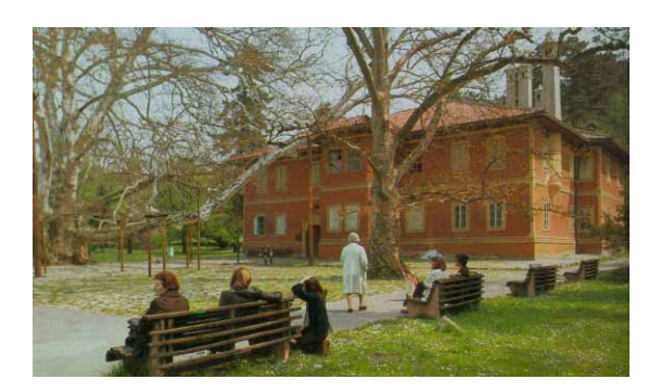
Illustration 4: Topčider Park with Miloš's palace

There are two versions of the story about where Dositej himself wished to be buried. According to one, it was in the place where his grave is today, the cathedral (Vilovsky 207). Another claims, however, that he wanted to rest in Belgrade's Topčider Park (Illustration 4). Both places symbolize a posthumous connection to the Obrenović dynasty — the first due to the kings' graves in the Sab-