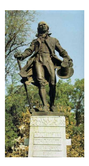
Illustration 5: The Dositej-statue in Belgrade's Students' Park